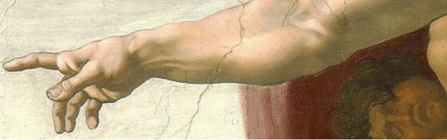
| Creation of Adam, Michelangelo

the scantron test, multiple choice, fill in the blank . . . all easily gradable and easily quantifiable testing.