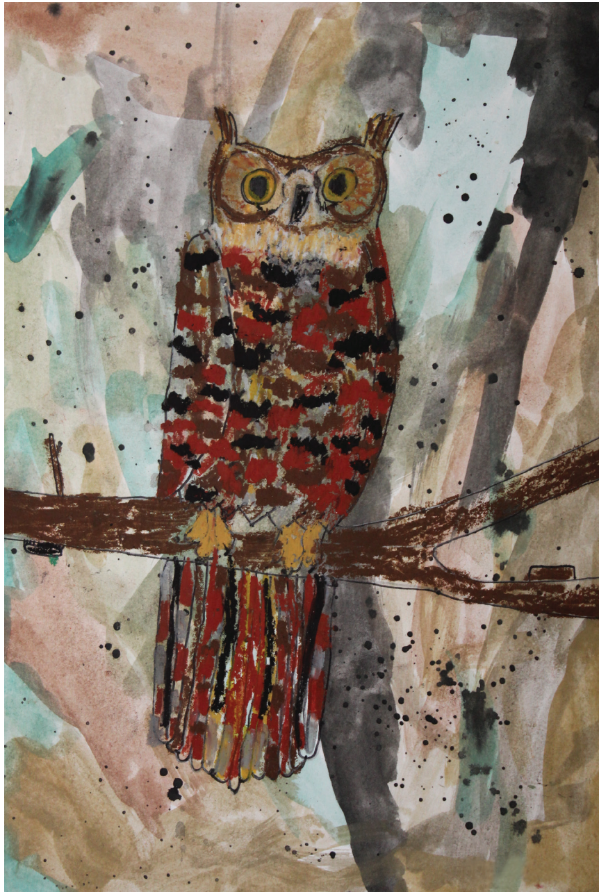
| Ambleside Southern Africa – Student Grade 2

We consider these in the atmosphere we foster in the classroom and in how we're living. Beauty is all around us, but we must learn to notice and recognize it. We begin in the classroom with beautiful music, art on the walls, wooden furniture. These all play a part in developing the aesthetic sense in a child while at the same time valuing the child as a person who has great capacity. The children learn from the adults around them and respond to what is in the Atmosphere. As educators, we realize our part in setting an example as seekers of truth, goodness, and beauty.