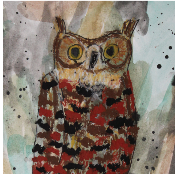
| Ambleside Southern Africa — Student Grade 2

intensely private person, and some aspects of her life have only come to light over the last ten years. Here are some lesser-known facts about Charlotte.